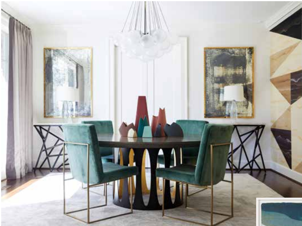
Interior design by Aida Saul